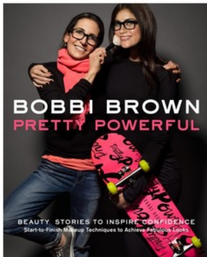
Pretty Powerful

produces innovative products and treatments to superficially enhance an individual. However, the spirit and heart of beauty is not something one can find on a drugstore shelf or cosmetic counter. The creative and inspirational women who've contributed to the progress of this industry exhibit a passion and spirit that can be defined as the true essence of beauty. Much like those in beauty, inspirational women are rewriting the recipe of success, leadership and personal revival. We've rounded up four inspirational books that highlight exceptional women who've fearlessly chased their goals and used their unique talents to achieve greatness in their respective fields.