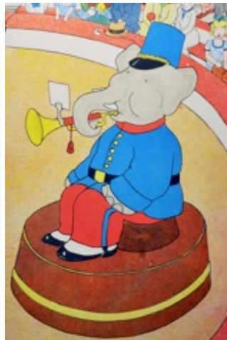
Jean de Brunhoff watercolor, Bibliothèque Nationale de France